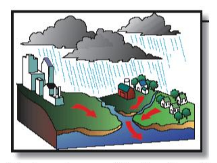
Drainage Areas and Surface Runoff

Calculation of peak storm water runoff rate from a drainage area is often done with the Rational Method equation (Q = CiA). Use of Excel spreadsheets for calculations with this equation and for determination of the design rainfall intensity and the time of concentration of the drainage area, are included in this course. The parameters in the equations are defined with typical units for both U.S. and S.I. units.